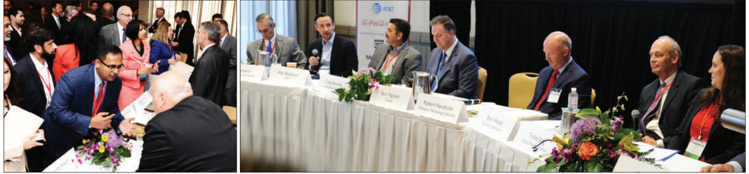
HIGH-LEVEL NETWORKING (From left): Suppliers connect with CPOs of Fortune corporations following the CPO Forum; The esteemed panel share their industry insights to a capacity audience hungry for precious information and opportunities, and best practices at the CTO/CIO Forum.