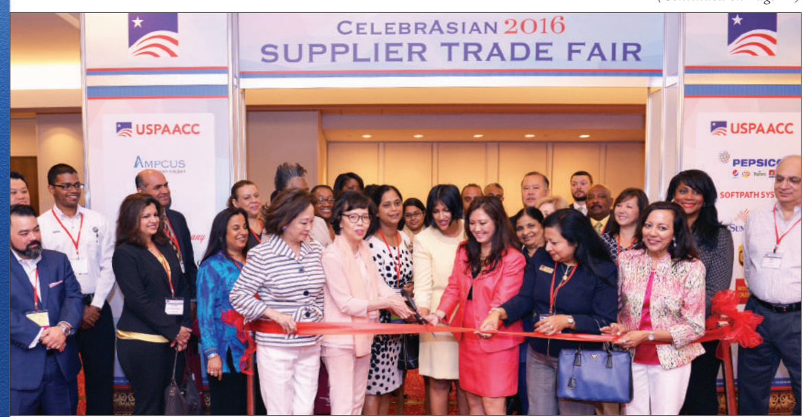
An auspicious tradition: At the CelebrAsian Procurement Conference 2016 ribbon-cutting ceremony, with corporate and Asian American co-chairs and sponsors, to officially open the Supplier Trade Fair and USPAACC's signature one-on-one business matchmaking meetings on June 3, 2016 in Atlanta, Georgia.