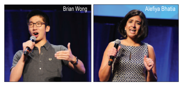
Watch; " Business Insider's "Top 25 Under 25 in Silicon Valley and 18 Most Important People in Mobile Advertising;" and Canada's "Top 20 Under 20," among other distinctions.

Since then, he has received several awards, including the "Forbes 30 Under" list at the age of 20; Mashable's "Top 5 Young Entrepreneurs to