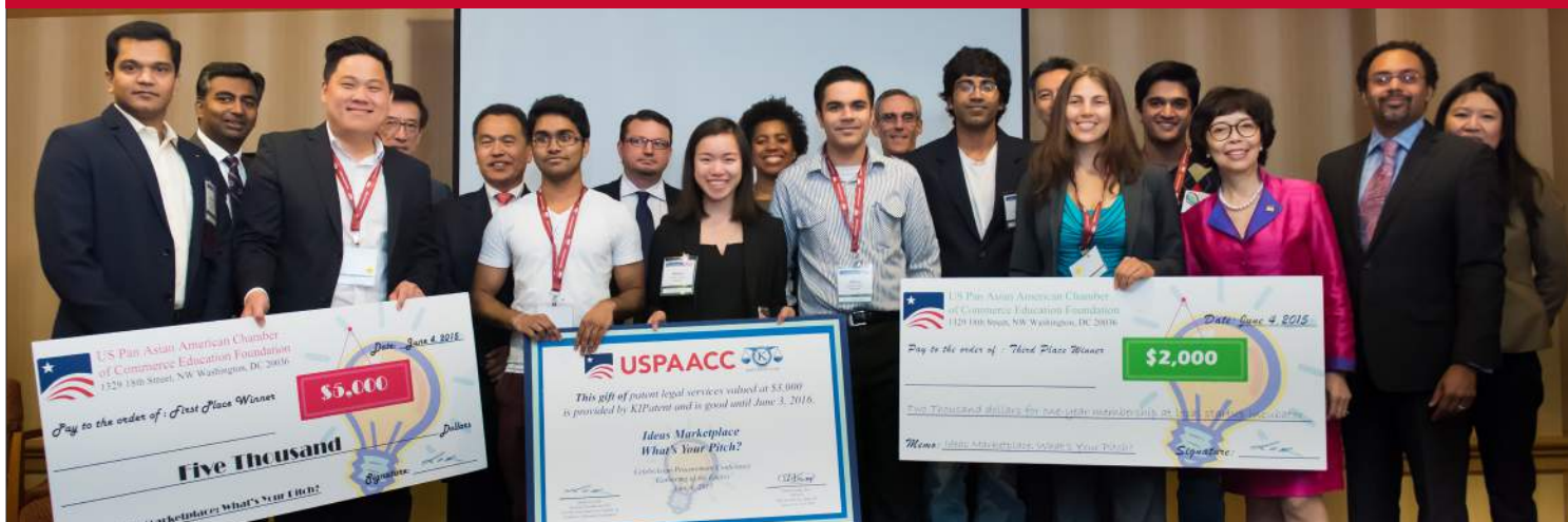
Innovation and entrepreneurship: Winners of USPAACC's "Ideas Marketplace: What's Your Pitch?" competition with judges and selection committee members