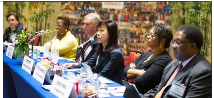
Government panel lays out federal contracting opportunities for minority suppliers.