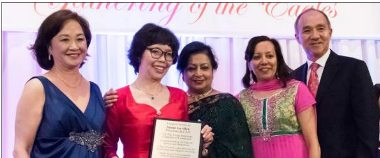
▼ USPAACC National President and Regional Chapter Presidents gather on stage