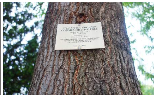
▲ Clockwise from top: Winners of Fast 100 Asian American Business Awards; USPAACC members visit the Maple Tree planted in 2010 also on the U.S. Capitol Grounds to commemorate USPAACC's 25th Anniversary; The Oak Tree, also known as the "Prosperity Tree," was planted by USPAACC in 2005 on the U.S. Capitol Grounds to commemorate the organization's 20th Anniversary; Winners of Fast 100 Asian American Business Awards