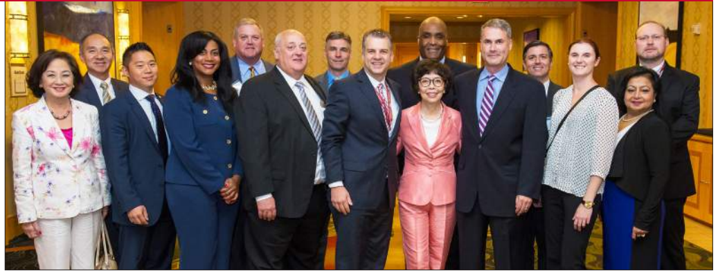
▲ Top-level procurement officers of Fortune Corporations are joined by USPAACC leadership before the start of the Corporation Procurement Officers Forum