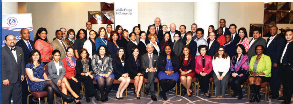
Industry influencers and business leaders at the Chamber Training Institute: The leadership of the different Chambers of Commerce from all over the country converged at the JW Marriott Hotel in Washington, DC on March 23 - 24, 2015 to foster alignment and collaboration within and across chambers with the goal of driving greater and mutual opportunities for all. USPAACC joins the U.S. Hispanic Chamber of Commerce (USHCC) who planted the seed, National Black Chamber of Commerce (NBCC), National Gay and Lesbian Chamber of Commerce (NGLCC) as stakeholders in this joint venture sponsored by Wells Fargo.