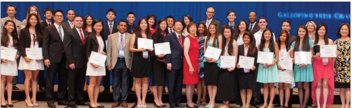
Our community's future leaders (2014), from top right: Winner of Denny's Hungry for Education scholarship; (Above) Last year's scholarship award recipients are joined on stage by their Asian American and Corporate sponsors, and several members of the Scholarship Selection Committee after the special luncheon held in honor of the students.