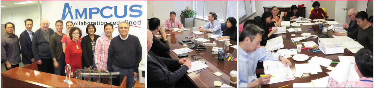
Members of the USPAACC Scholarship Selection Committee pore over several boxes and binders of applications at the Ampcus headquarters in Chantilly, Virginia.