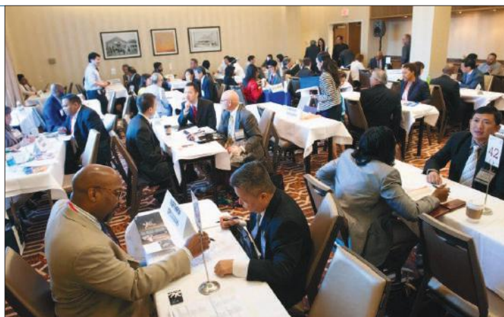
Exploring procurement opportunities: Asian American and other minority suppliers connect with buyers from Fortune corporations on the third day of CelebrAsian Procurement Conference 2014 in Tysons Corner, Virginia.

For more information, visit www.uspaacc.com