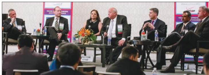
Top-level procurement officers discuss domestic and global trends in the supply chain.