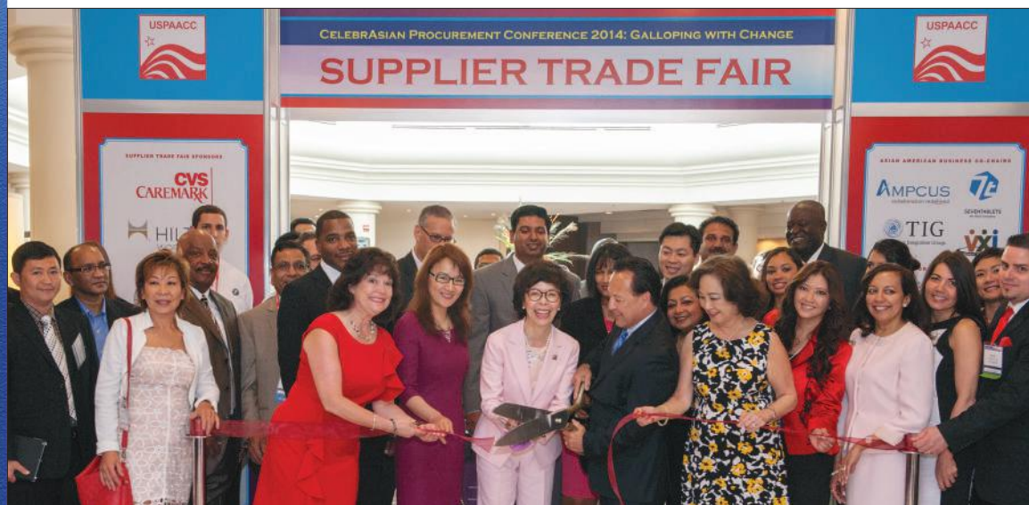
Opening the gateway to procurement opportunities: At the traditional ribbon-cutting ceremony that officially opens the Supplier Trade Fair and One-on-One Business Matchmaking Meetings on the third day of USPAACC's CelebrAsian Procurement Conference in Tysons Corner, Virginia.