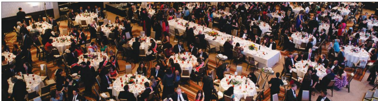
Capacity crowd at the black-tie Excellence Awards Gala during CelebrAsian Procurement Conference 2014, held June 2-4 at Sheraton Premiere in Tysons Corner, Virginia.