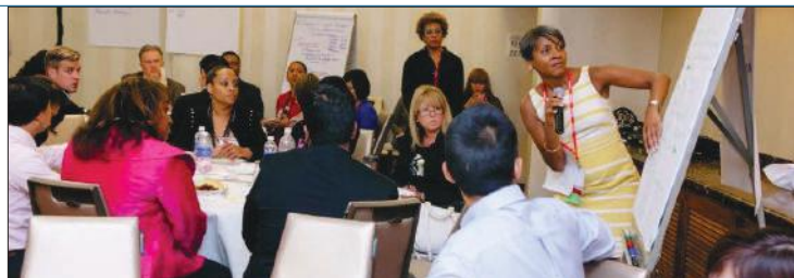
Supplier Diversity Managers Caucus participants discuss strategies and solutions.

USPAACC's conference workshops are approved by the Institute of Supply Management (ISM) and participants will get Continuing Education Hours (CEH) credits. Supplier Diversity professionals participating in CelebrAsian can use these credits to apply to ISM for Certified Professional in Supply Management® (CPSM®) recertification, Certified in Supply Management (CSM), Certified Professional in Supplier Diversity® (CPSD) recertification, Certified Purchasing Manager (CPM) recertification or Accredited Purchasing Practitioner (APP) reaccreditation. 🌐