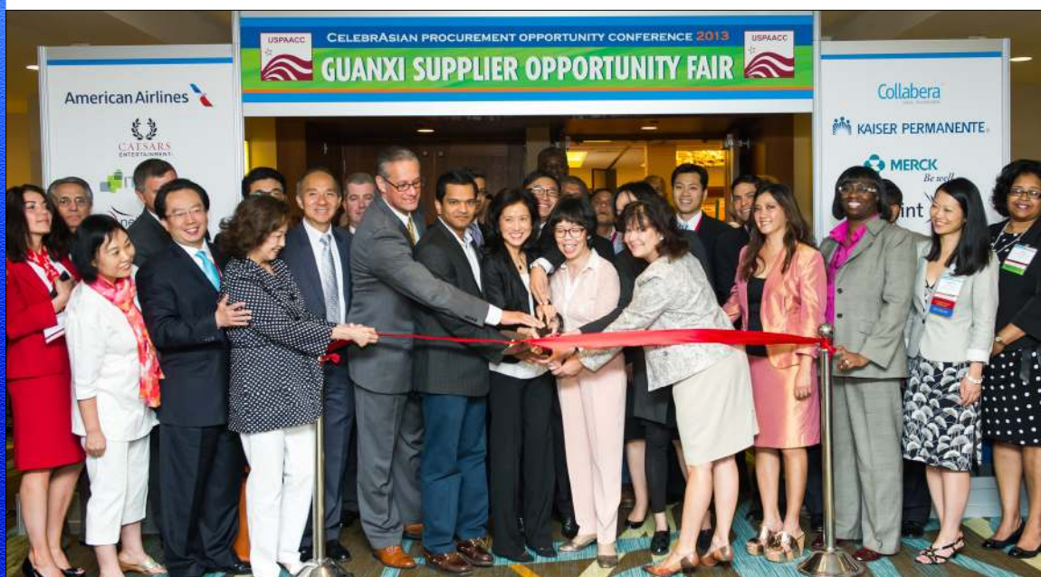
Creating an auspicious start: At CelebrAsian 2013 ribbon-cutting ceremony to officially open the Supplier Trade Fair and USPAACC's signature pre-scheduled one-on-one procurement matchmaking sessions on June 5, 2013 in Garden Grove, California.