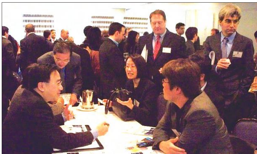
USPAACC-EF Procurement Connections in New York City.