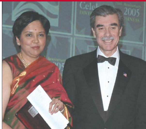
At the 2005 CelebrAsian Business Opportunity Conference in Washington, DC (from above left): PepsiCo Chairman & CEO Indra Nooyi and U.S. Secretary of Commerce Carlos Gutierrez (former CEO of Kellogg's).

Indra joined PepsiCo in 1994, and was named President & CFO in 2001. In 2006, she was named CEO of PepsiCo, becoming the fifth CEO in PepsiCo's 42-year history. ●