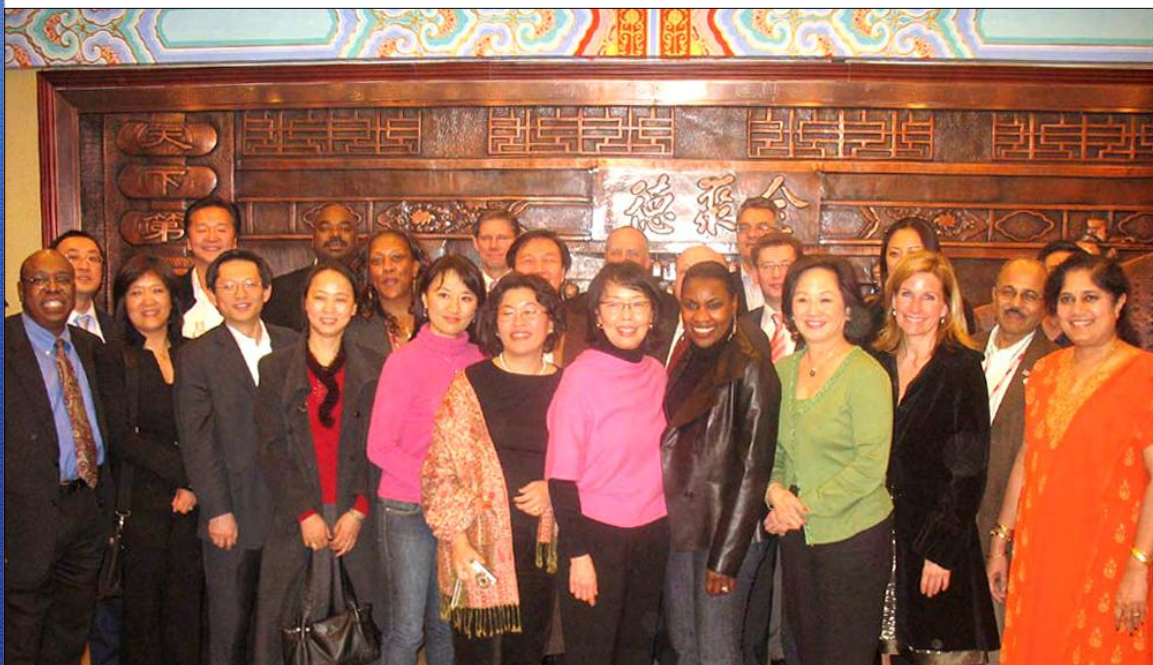
Harbingers of Economic Growth: The China Trade Mission delegation in Beijing, the first stop in their three-city sojourn that included Dalian and Shanghai, in February (story and more photos inside).