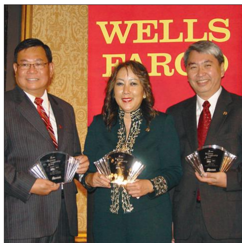
Winners of the 4th Annual Asian Business Leadership Award in San Francisco, California in May 2007

Three more winners to be announced during CelebrAsian Business Opportunity Conference '08