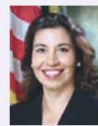
The Honorable Anna Cabral U.S. Treasurer