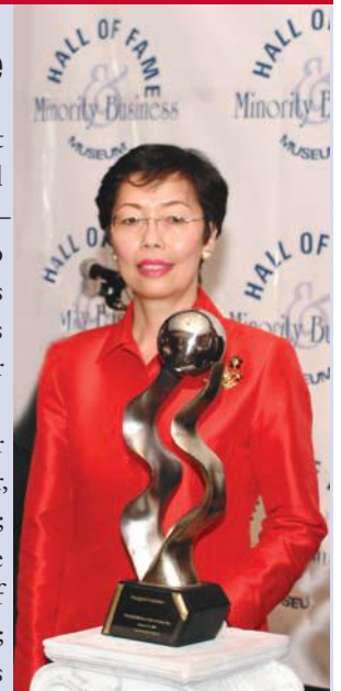
Accepting the Hall of Fame Award at the Harvard Club in New York City