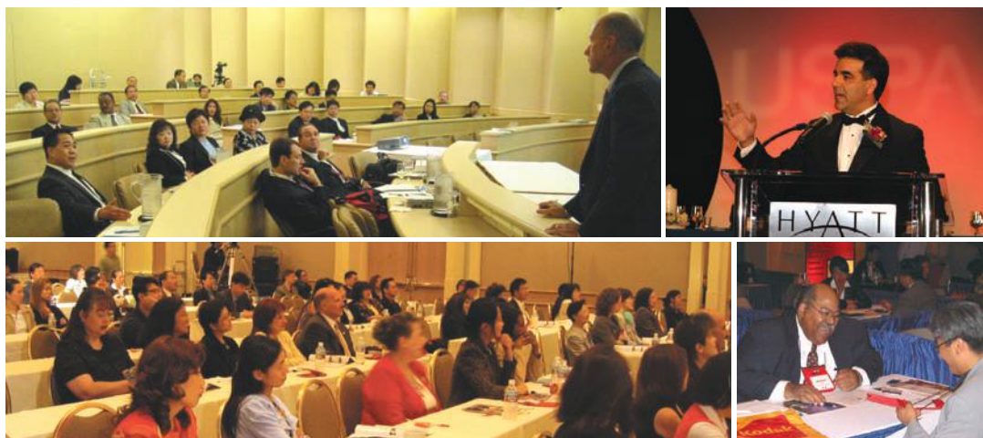
At last year’s CelebrAsian in Irvine, CA (clockwise from top left): One of the many informative seminars at the conference; Keynote Speaker SBA Administrator Hector Barreto; an Asian American supplier meets with a Supplier Diversity Manager at the Guanxi* Supplier Opportunity Fair; and participants at the groundbreaking Woman Pioneers Symposium. *Guanxi is a commonly used Chinese business term meaning “connections” or “relationships.”

Through CelebrAsian , USPAACC has brought pioneering programs such as Break Cultural Barriers to Succeed, Woman Pioneers Symposium, Import/Export Series, Supplier Diversity Managers’ Summit, Franchising and the renowned Guanxi* Opportunity Fair (*Guanxi is a commonly used Chinese business term meaning “connections” or “relationship”) that features pre-scheduled one-on-one meetings between suppliers and buyers—bringing added value to the Asian American business community and their partners