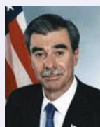
The Honorable Carlos M. Gutierrez U.S. Secretary of Commerce